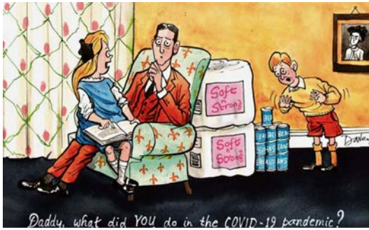
Daddy, what did YOU do in the COVID-19 pandemic? "Panic Buying" left many without vital supplies

It is true, many jokes were circulated at the time to lighten the mood.