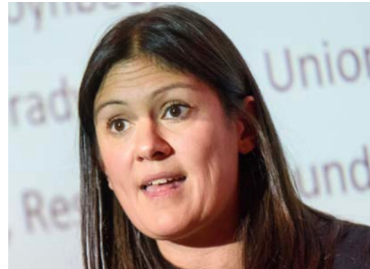
Prime Minister Lisa Collis - 2024

Yet, despite that, the fickle British public elected the Labour Party's new leader, Lisa Collis (née Nandy), the result invoking headlines in the press recording memories