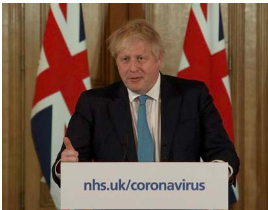
Prime Minister Boris Johnson - 2020

One section tells of the surprise defeat in the 2024 General Election of Boris Johnson, the Prime Minister who had navigated the country through the unprecedented